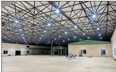
Space Frame Structure