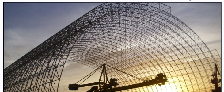
Barrel Vaults (Coal Sheds)

JAZARI STEEL – Building the Future, Today.