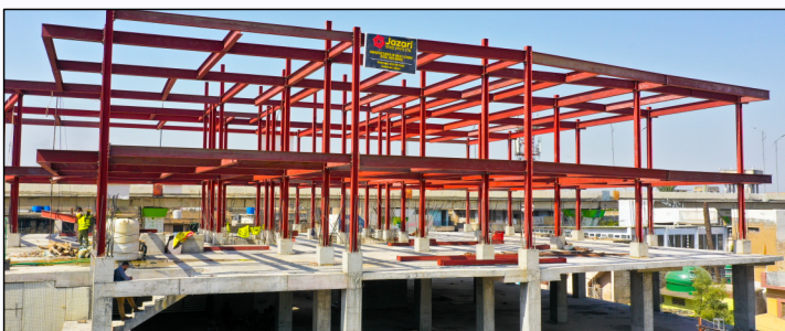
Multi-Story Steel Structures