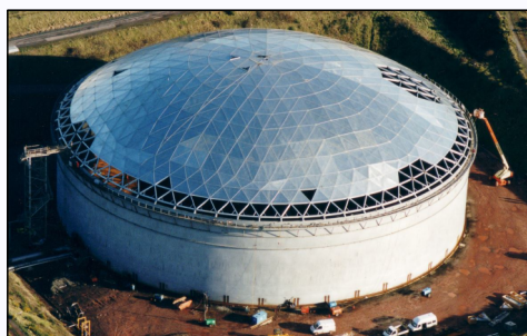
Aluminum Dome Roof